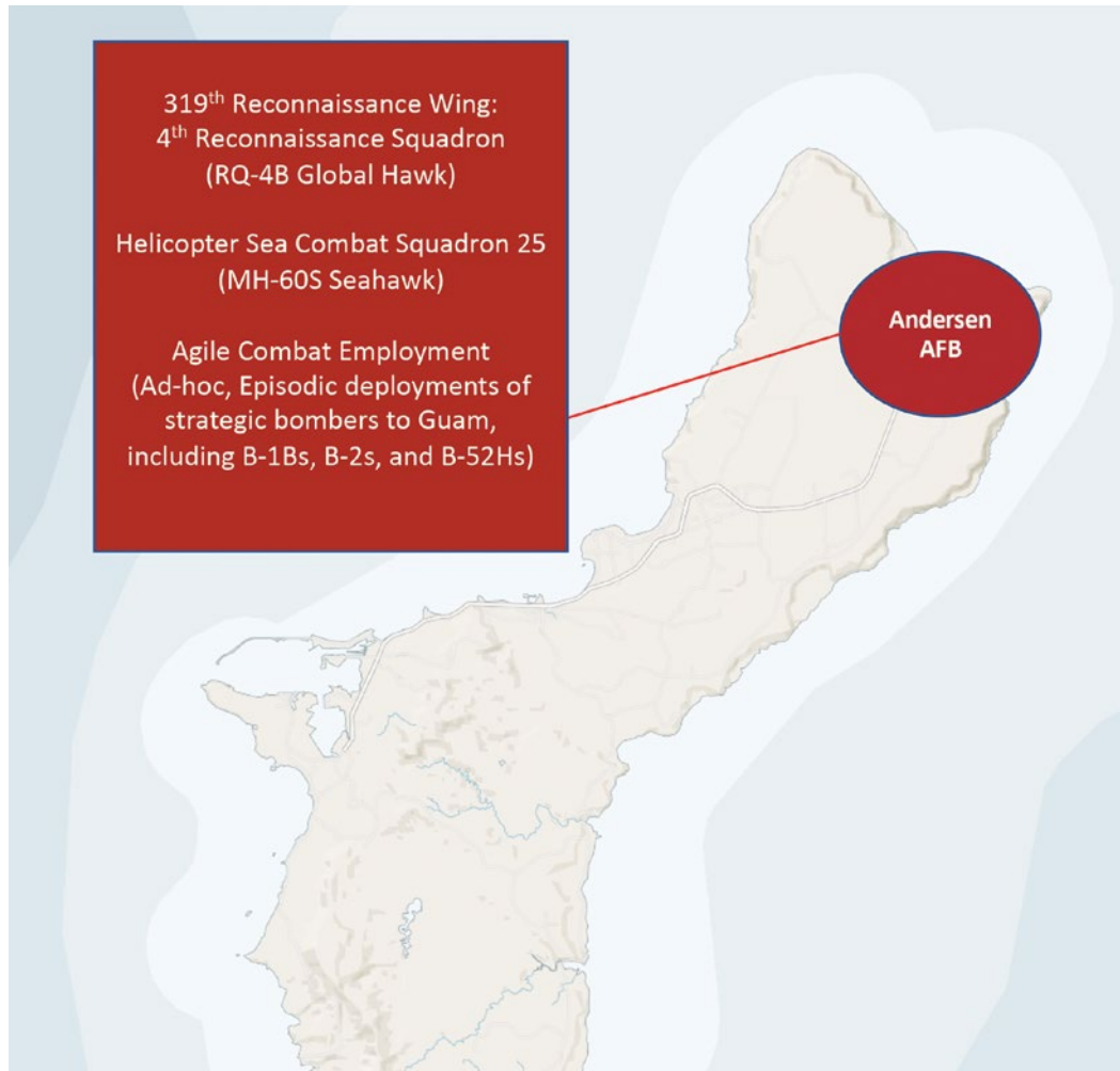
FIGURE 3: GUAM FORCE POSTURE IN 2022