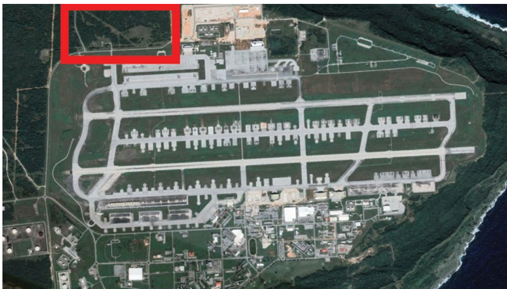
FIGURE 4: AAFB NORTH RAMP WITH PROPOSED RSAF DETACHMENT LOCATION HIGHLIGHTED

Source: 13°35'00.23" N, 144°55'36.56" E, LandSat/Copernicus, Google Earth, January 2, 2018. Graphic adapted from images and information found in United States Air Force, Public Scoping for Infrastructure Upgrades at Andersen Air Force Base, Guam , p. 2, https://aafbinfrastructureeis.com/application/files/1116/1763/7031/AAFB_Infra_EIS_Scoping_Brochure.pdf