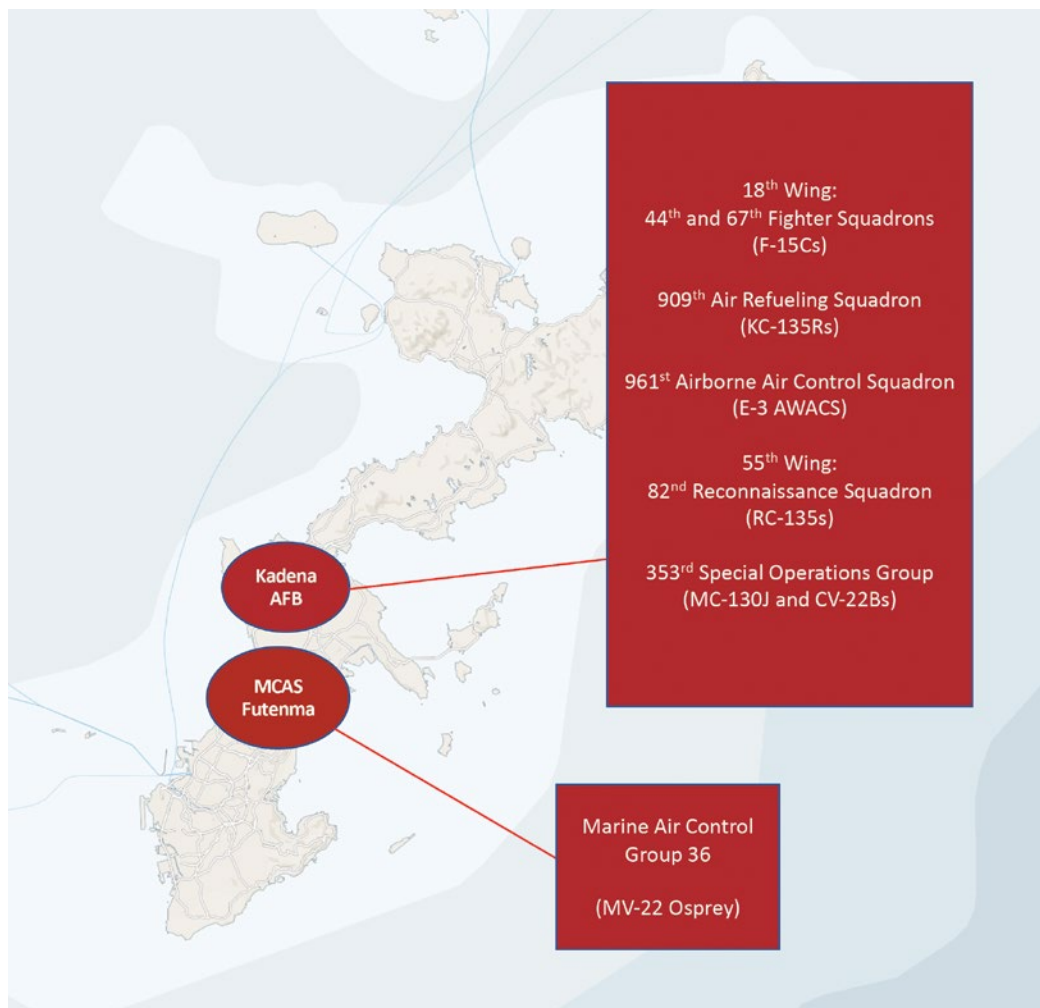
FIGURE 2: OKINAWA FORCE POSTURE IN 2022